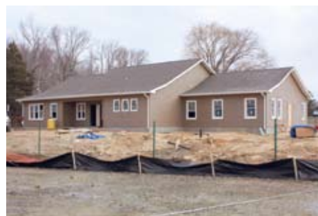
Side view of the new cottage under construction.