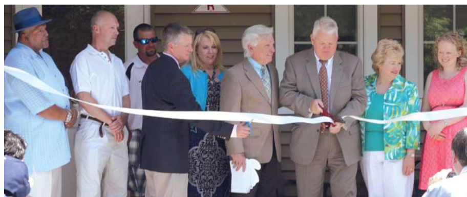
(above) Pictured at the June 1 Campbell House dedication and ribbon cutting ceremony