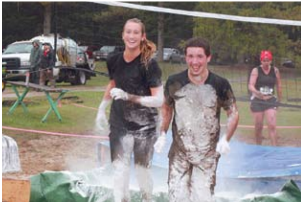
Mud turned white as runners emerged from the flour pit.