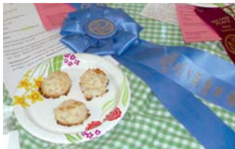
FCS students' coconut macaroons won Best in Show at the 2014 Salem County Fair.

FCS students began the school year by learning the basics of cooking and good nutrition. Lessons include areas such as kitchen safety, healthy breakfasts, fruits and vegetables and baked goods. The students plan and prepare foods, and host a Christmas Open House. Everyone gets involved, which allows students to research recipes and see how well they turn out. Other areas covered in the FCS program are parenting, child care, sewing, crafts and international foods.