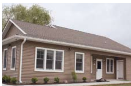
(right) Phase 1 Campbell House completed.