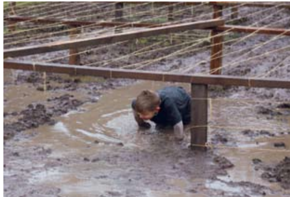
Even the little ones got muddy at the Muddy Bottom Run!