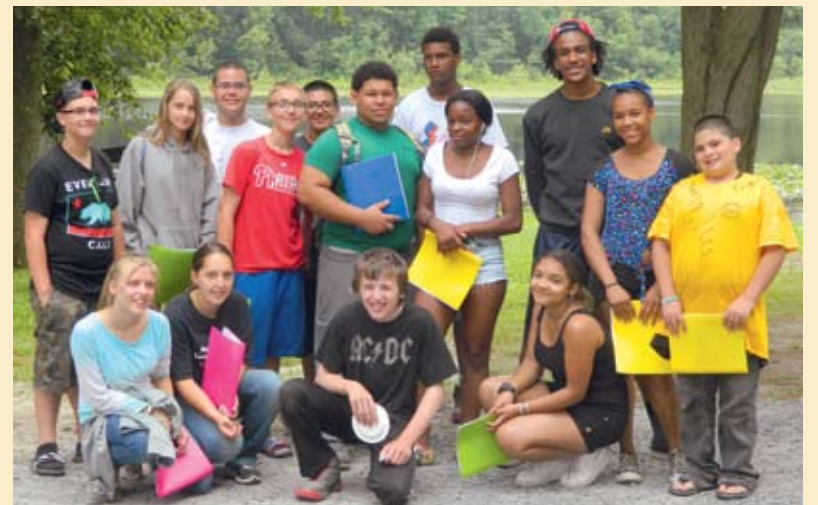
Pictured is the first graduating class of Super Storm Sandy Life Skills Camp.

Special thanks to the volunteers who donated their time to talents in life skills training. We are blessed to have touched the lives of these young people, and are proud to have given them skills that will help them any remain "stronger than the storm."