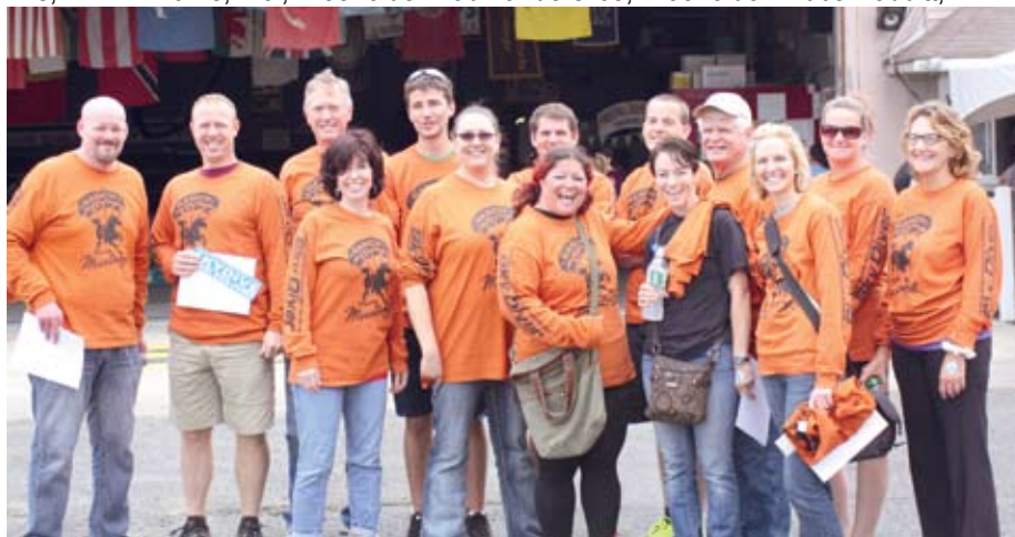
The Flying Mustangs jumped to support Ranch Hope children.