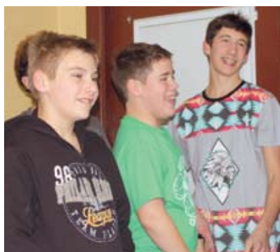
The boys in Hunt Cottage enjoyed their Christmas decorating party with the Salem County Auxiliary.

Everyone who attended these events had a great time and enjoyed some delicious food, good fellowship and special treats. It was a beautiful Christmas season at Ranch Hope. We thank our Giving Tree partners, donors, volunteers, auxiliary members, families and visitors who participated and supported our youth. Your loving kindness is greatly appreciated by our youth and staff!