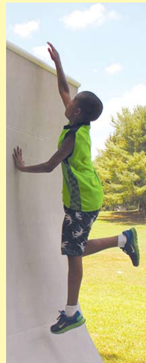
Up for the challenge!

There are many fun activities to choose from at Camp Edge.