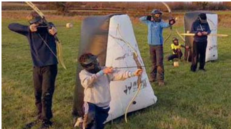
Archery Tag® is new for 2017!