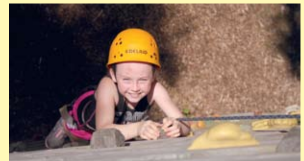
Climbing a rock wall is a big challenge.