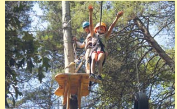
Ziplining is fun and exciting.