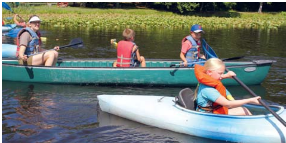
Fun time on the water learning safety and adventure.