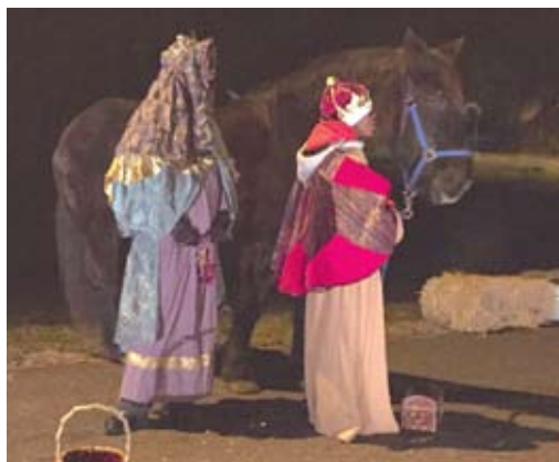
Celebrating the Season at the Ranch.