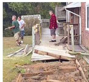
Renovations begin on the ramp and sidewalk outside the Alloway Shelter of Hope

We hope you are able to visit us in Alloway to see that renovations have begun in and around the Shelter of Hope building.