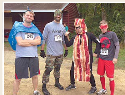
Pictured are "The Baconator" and his super-hero friends before the race.