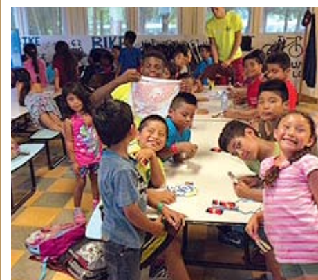
Children enjoyed indoor activities on a rainy day during Harvest of Hope Camp in July.

*This event is sponsored in partnership with the Family Enrichment Network, and funded by The Pascal Sykes Foundation.