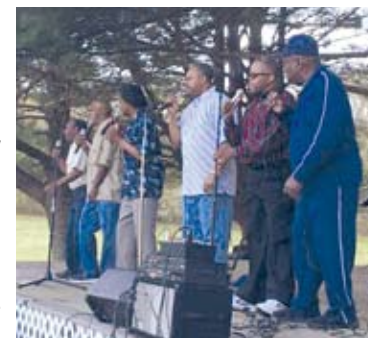
The Hopewell Male Chorus performs at Gospel Fest on May 2.

Stay tuned for information on the spring 2016 Bike to the Edge and Gospel Fest!