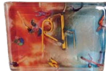
This group sculpture represents a culmination of the students' work.

Non-Profit Org. U.S. Postage PAID PERMIT #11 Pennsville, NJ 08070