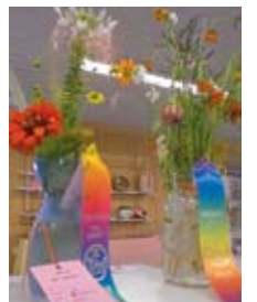
Students showcased their floral arrangements at the Salem County Fair in August.