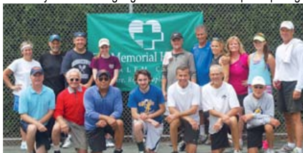
Players from the inaugural Wranglers Tennis Classic.

Hold the date —the Wranglers have tentatively set June 3, 2016 for the next golf and tennis event, and we hope to see you there!