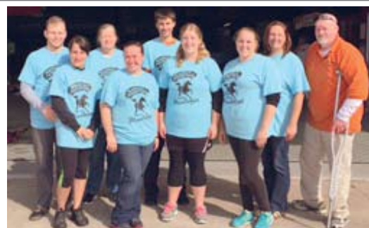
Members of the Flying Mustangs Skydive Team.

Link to our website, www.ranchhope.org by scanning the QR code.