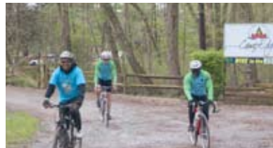
Riders leave Camp Edge and arrive in Fortescue, the furthest checkpoint.

Five miles or 62 miles—that was the question! The Bike to the Edge ride was held on Saturday, May 2, and riders had their choice of five different routes ranging from five to 62 miles. The response to this Camp Edge fundraiser was fantastic with 60 participants. The routes were very well-marked with rest and refreshment stations every 10 miles. The routes started and finished at Camp Edge, with the furthest point out being near the Delaware Bay in Fortescue. Every rider was offered a bike helmet, donated to Camp Edge by the Bridgeton VFW—there were so many helmets donated that 20 were given to the boys at the Ranch! We are very grateful to Bridgeton VFW and our sponsors for the success of the ride, which raised $3,000 to help children attend summer camp.