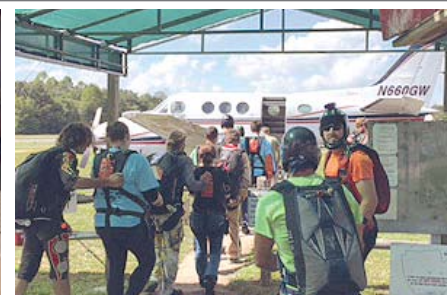
A group of Flying Mustangs board the airplane for their jump.