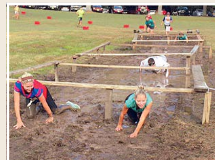
Runners crawl through the mud pit.

More than 55 people trudged through dirty obstacles on October 11 to help Camp Edge. They crawled through a mud pit, walked in a lake, and slithered through a pit filled with Jello. All of this "fun" was for a good cause! The muddy runners and walkers raised funds to help Camp Edge bring children to summer camp. Special thanks to everyone who sponsored, donated, participated and volunteered.