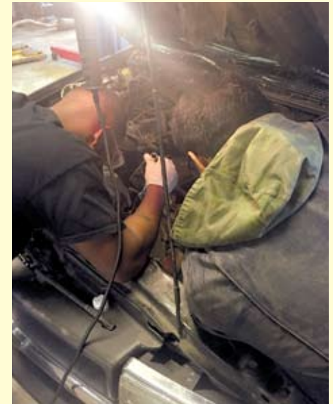
Students in Automotive Technology prepare an engine for removal.

Whew! We have been busy, haven't we? Be on the lookout for these upcoming spring and summer events: Annual Sports Banquet on March 23, Easter Egg Hunt, Charter Boat Fishing Trip in June and an exciting summer-long competition!