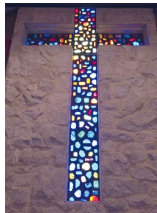
Shown is a view of the cross from inside the Chapel reflecting the sun outside.

Were the whole realm of nature mine, That were a present far too small; Love so amazing, so divine, Demands my soul, my life, my all."