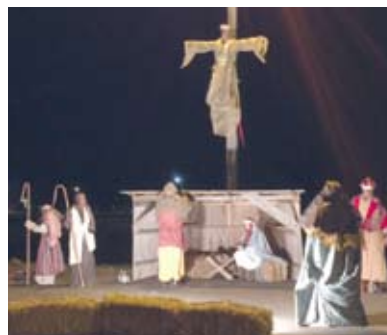
Ranch Hope youth, staff and volunteers presented the first-ever drive-through Live Nativity in December.