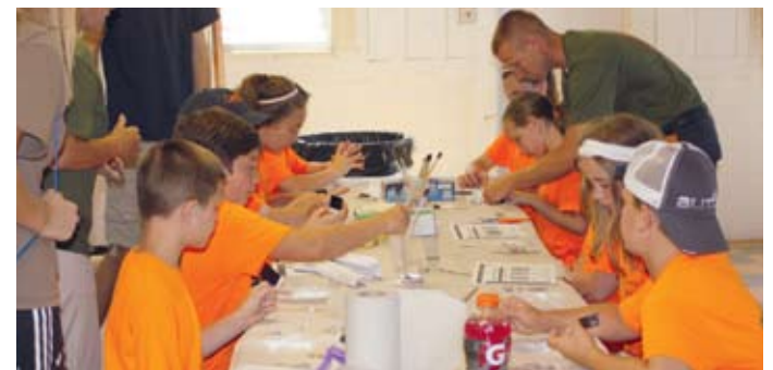
L.E.A.D.E.R.s Camp fingerprint class.