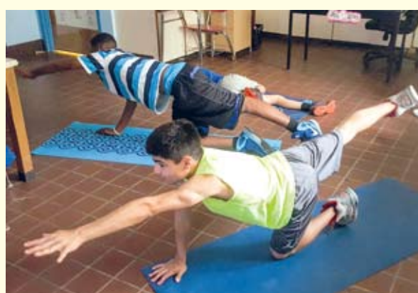
Science students warm up their minds and bodies with Yoga.