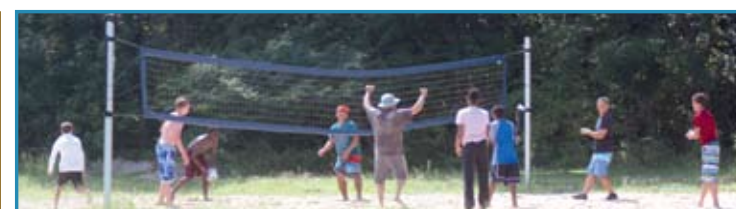
Youth and staff enjoyed a friendly volleyball game during the eclipse party.