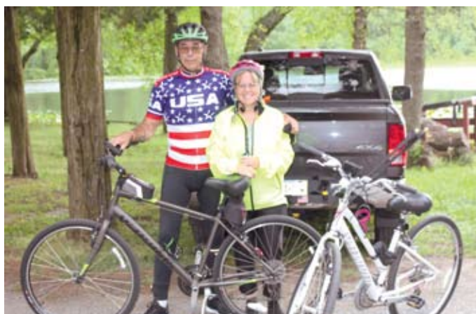
Taking a break during the Bike to the Edge event.