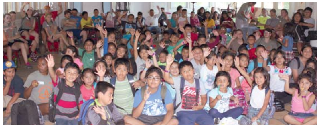
Harvest of Hope campers gather to pose for a picture.