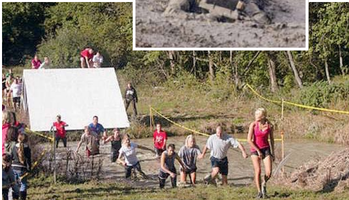
Another successful Mud Run event at Ranch Hope.