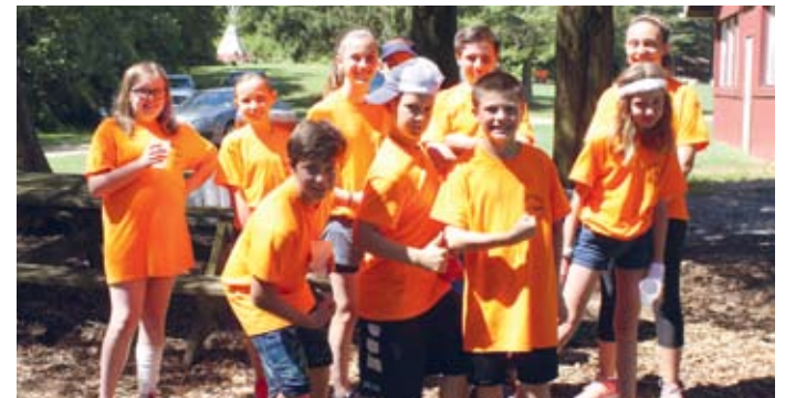
L.E.A.D.E.R.s campers show their muscles.

Stay tuned to www.CampEdge.org or call (856) 279-2519 for information on upcoming events.