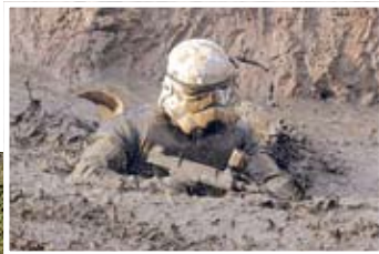
Mud Run Storm Trooper