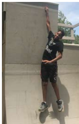
Accepted the challenge to reach top of the Warped Wall.