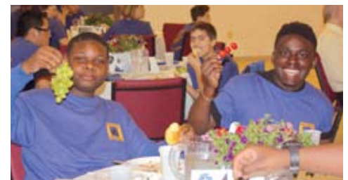
RH youth servers take a break to eat their dinner at the Founder's Day banquet.

We are thrilled to see the Lord working in the lives of these young people, and we congratulate them on their achievements.