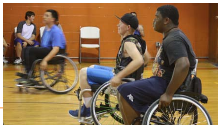
RH youth were up to the challenge of playing basketball in wheelchairs.

As the competition got underway, youth and staff experienced first-hand how it feels to play basketball from a wheelchair; to shoot foul shots, hit three-pointers and sprint down the court while powering the chairs with their arms. This was a very inspirational and uplifting evening of fellowship and friendly competition. We thank the Delaware Destroyers for being with us!