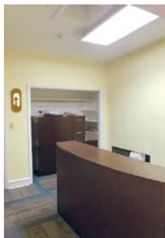
Pictured are newly renovated areas in the Welcome Center, including Reception and Treatment Services.