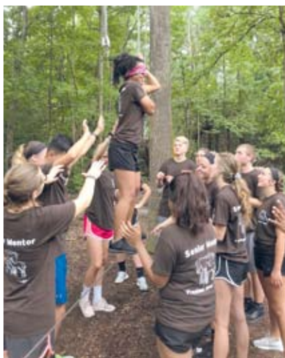
Youth help each other on the Camp Edge Ropes Course.

On October 6th, Camp Edge hosted the annual Muddy Bottom Run. This year's theme was Pirates and some runners dressed the part! Over 50 runners took on the five-mile course which included crawling, trudging, and running through mud, a Jell-O pit, flour pit, and multiple lake crossings. Thanks to our runners, we raised money to improve the camp and to help underprivileged youth attend our summer camps.