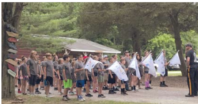
LEADERs Camp squads assemble for drills.

Contact us at CampEdge@ranchhope.org or (856) 279-2519 with any questions about scheduling a Ropes Course, Archery Tag, or even an inflatable obstacle course event.