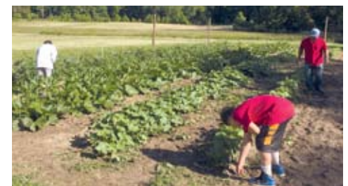
RH youth and staff work in the community garden as part of the Service Training Program.