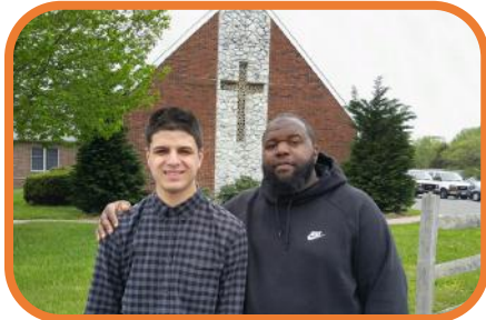
2018 marked Ranch Hope's 54th year of caring for children, youth and families.

“My staff treats me like I am his own family; when I need to talk, he is always there.” This very simple, straightforward statement made by a Ranch Hope youth means the world to us! It is you , our faithful supporters in the community, who enable us to provide this Christ-centered, compassionate care. See below some of the ways your very generous financial and volunteer contributions helped drive our ministry forward.