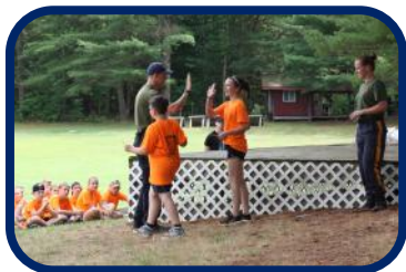
Scholarships helped children from the community enjoy summer opportunities at Camp Edge.