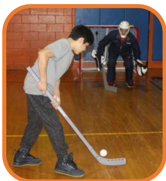
Youth and staff enjoyed an evening of fun and fellowship hosting the Liberty University Flames Men's Ice Hockey Team at our Sports Banquet.