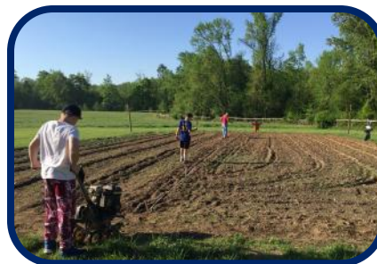
Enhanced career exploration and service training opportunities for youth included Catering, Community Gardening and CPR Certification.