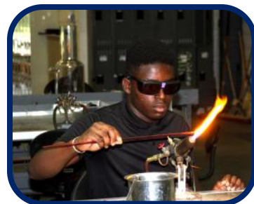
Youth participated in the fourth annual Art & Glass Week at Salem Community College.