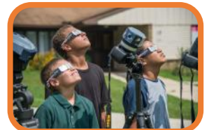
Youth safely enjoyed the Great American Solar Eclipse.